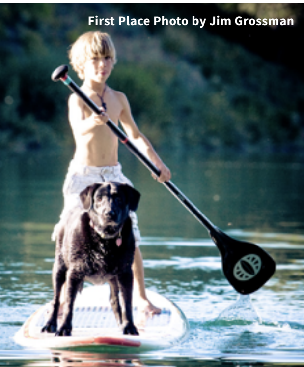
First Place