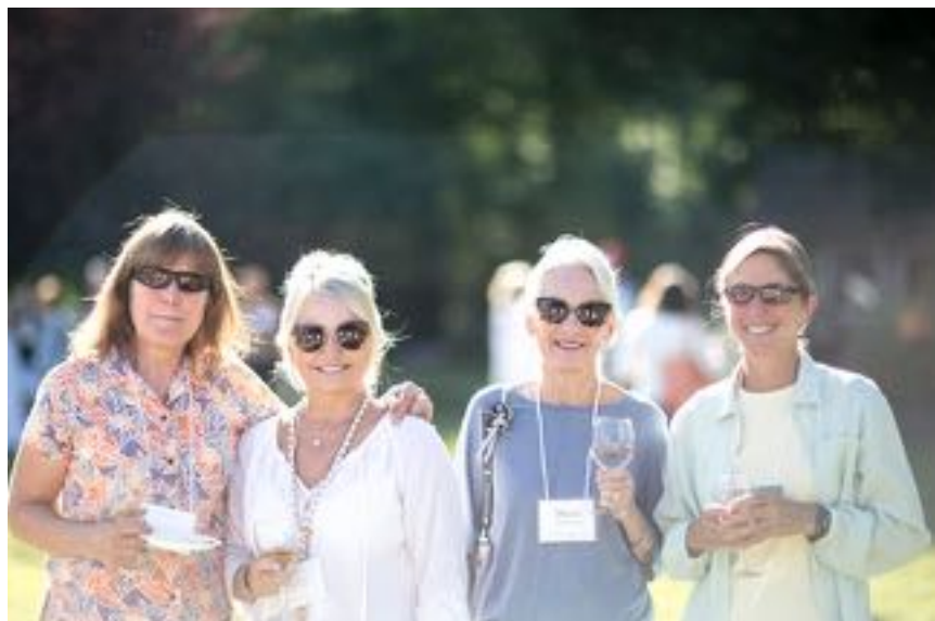
Land Trust supporters celebrate our work at our annual Donor Party.