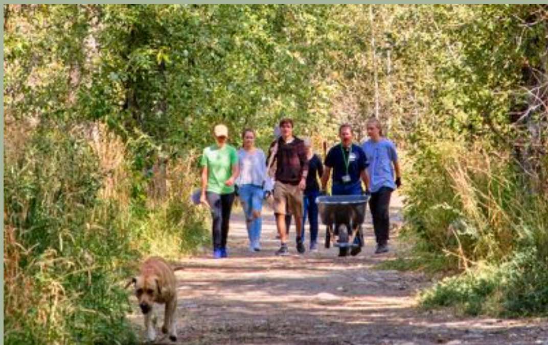
The Wood River High School's class of 2019 volunteers for the Land Trust.