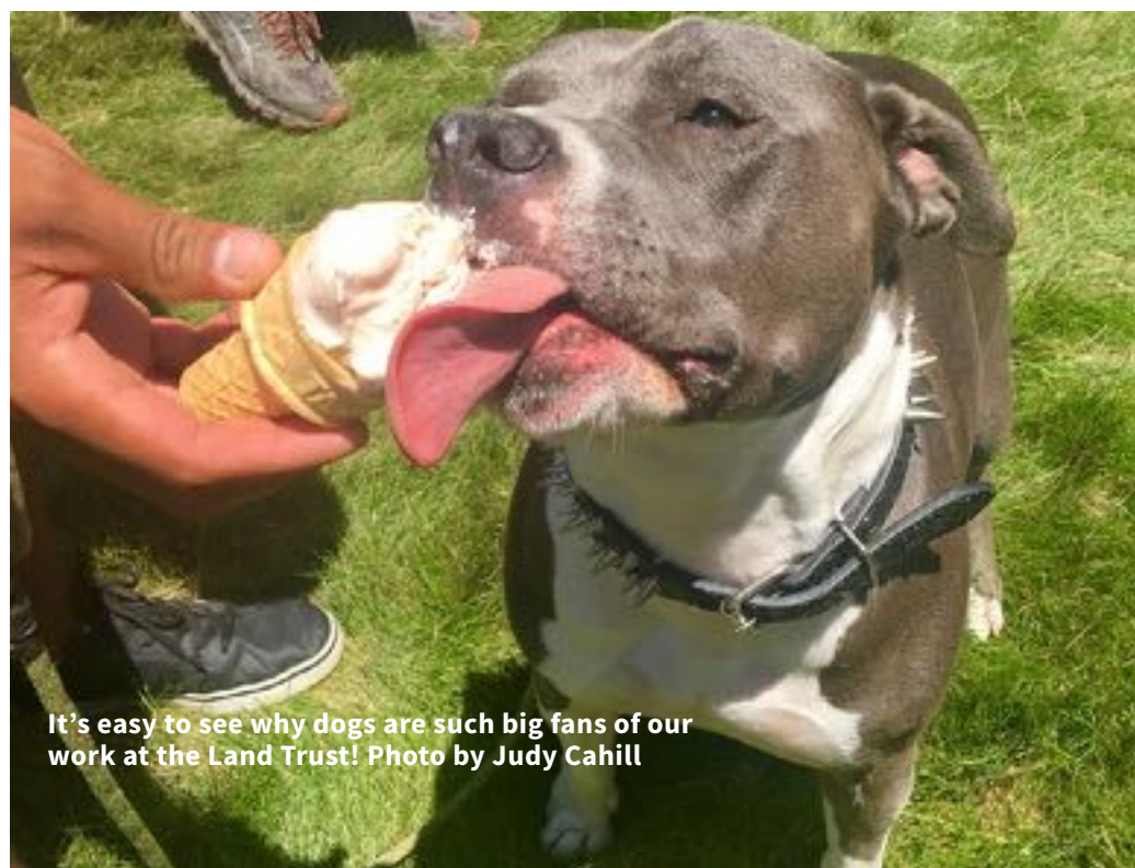
It's easy to see why dogs are such big fans of our work at the Land Trust!