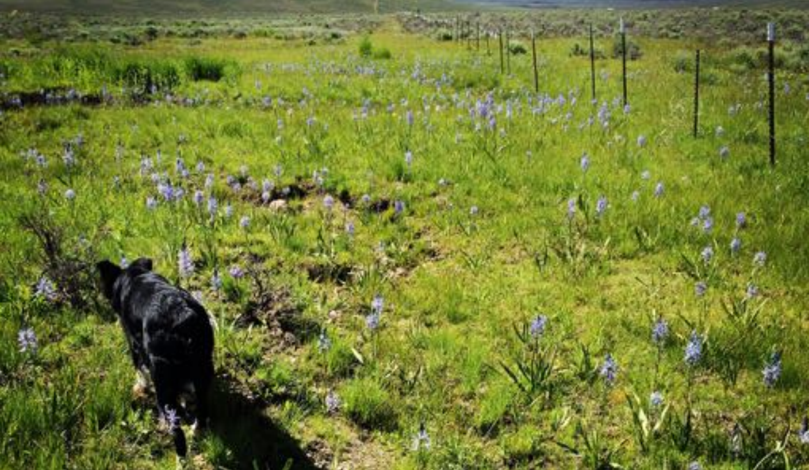
Frank, one of the Land Trust's four-legged team members, enjoys exploring Rock Creek Ranch.