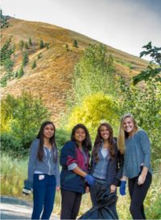
Future environmental leaders from Wood River High help keep the valley beautiful.