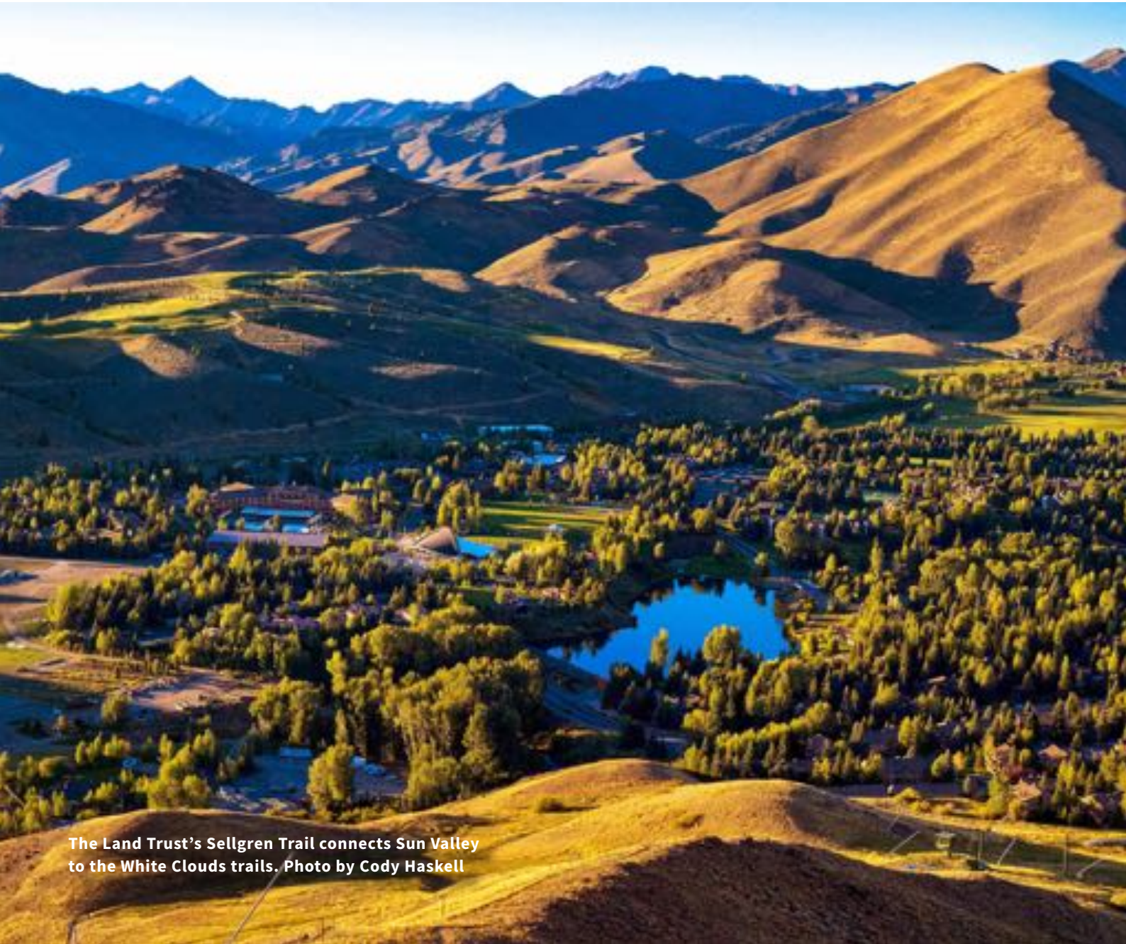
The Land Trust's Sellgren Trail connects Sun Valley to the White Clouds trails.