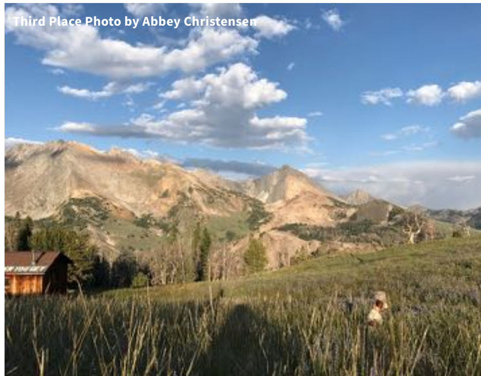
Third Place