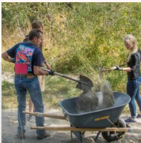
Wood River High School's class of 2019 cleans up trails at Draper Wood River Preserve.