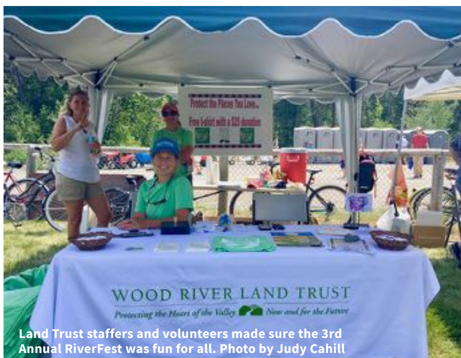
Land Trust staffers and volunteers made sure the 3rd Annual RiverFest was fun for all.