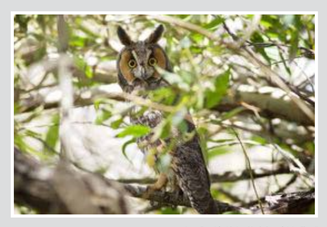
Long Eared Owl Below Magic Dam