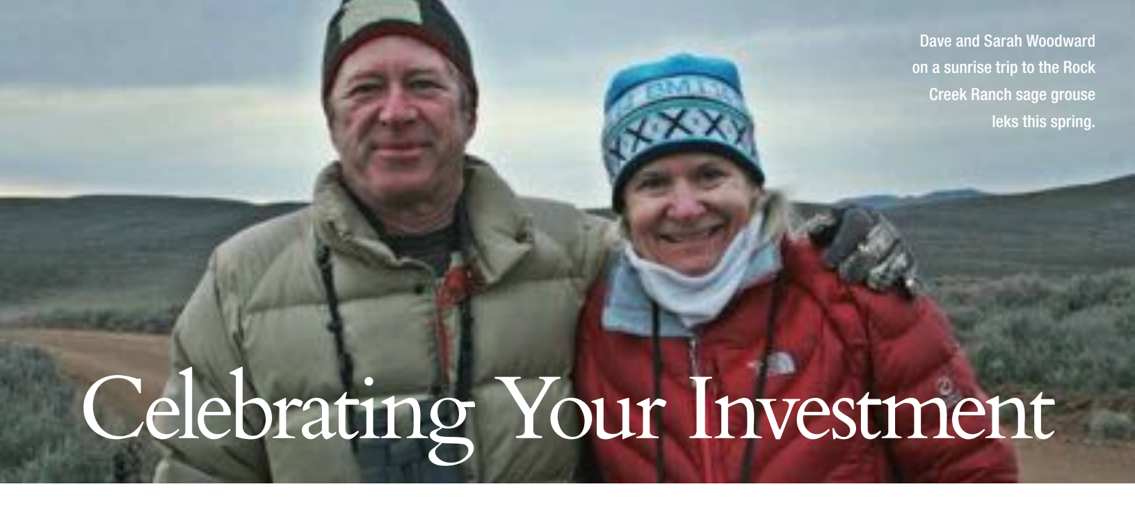
"The greatest use of life is to spend it for something that will outlast it." —William James

SAVING LAND is about protecting the things we love about where we live. The fresh air and incredible wildlife. The hiking, biking, and skiing trails. The working lands that keep us in touch with our history. It's about the clean water that supports everything from the trout in the stream to the snow they make on Baldy in the winter.