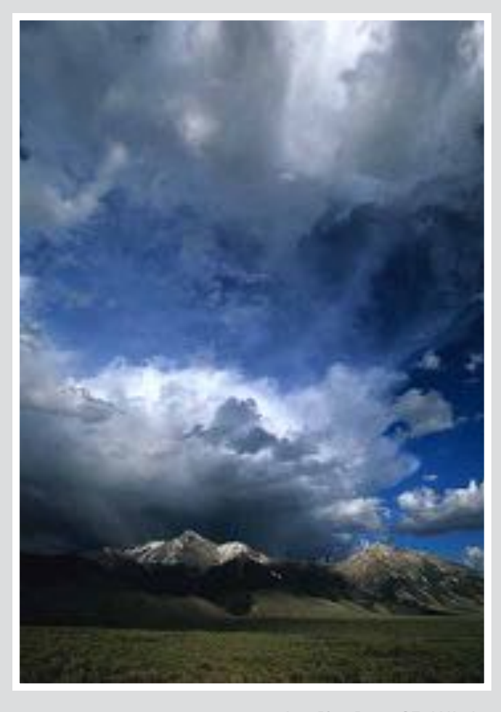
Lost River Range